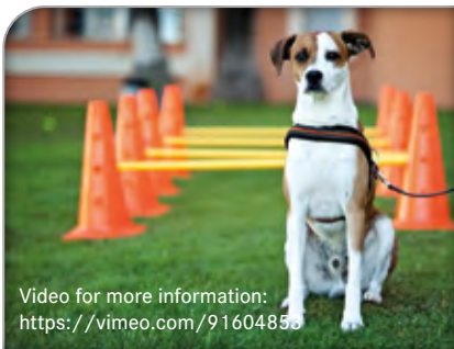
Video for more information: https://vimeo.com/91604853

Do you want to take the next step in your specialization? And get your training from the worlds' leading specialists? Get started any time with your e-learning part and join us for the presence days to focus on labs and interactive case work ups.