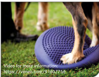
Video for more information: https://vimeo.com/91607756

Don't miss out to continue with your specialization now, as this particular treatment is of high importance in our rehab, geriatric, obese, ICU patients but also in sports and working dogs and in cats. Benefit from lots of interactive collaboration also after completing the course.